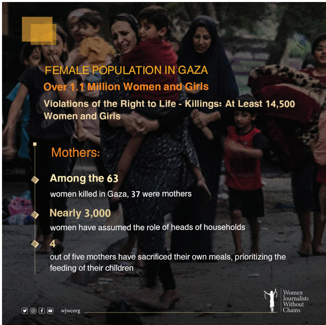
Figure 1 The impact of violence on Gaza's female population