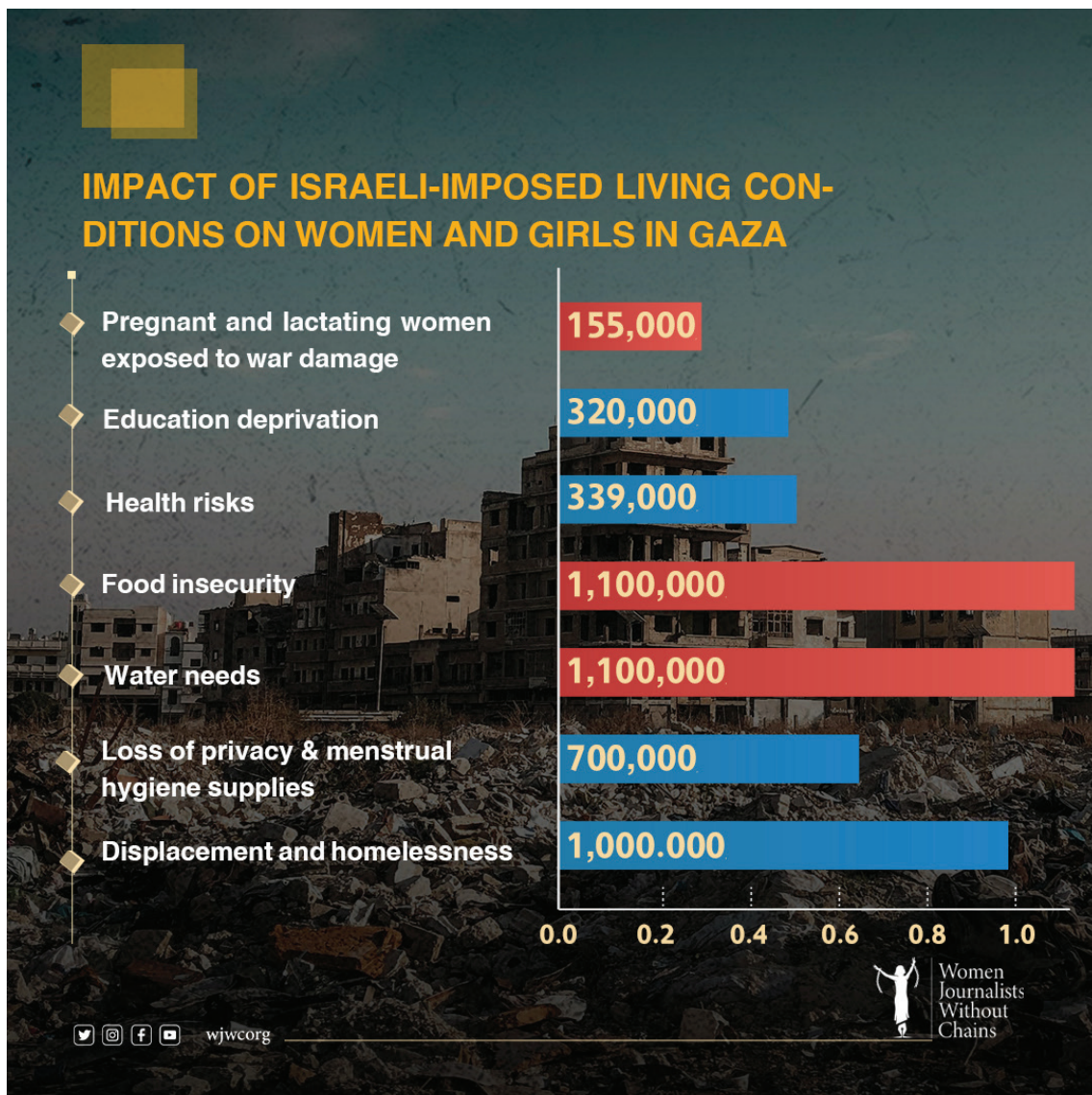
Figure 2 Impact of Israeli-imposed living conditions on women and girls in Gaza